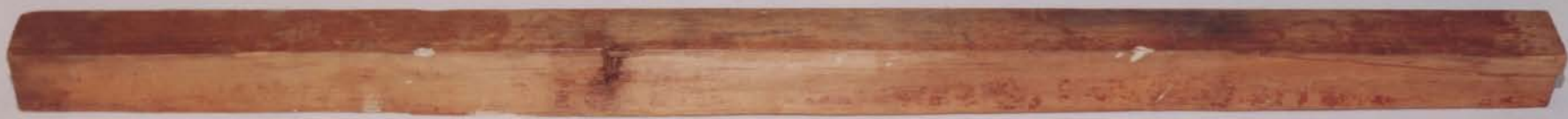
PIECE OF WOOD, 31 3/8" X 1 5/8" X 1 1/2".EVA-D-P-C- FP-82-70 Heint

PERICAD-Bayonne, N. J. GOVERNMENT EXHIBIT 421 B 75-26-CR-3