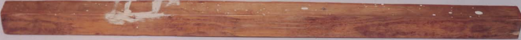
PIECE OF WOOD, 31 3/4" x 1 5/8" x 1 1/2". EA-D-P-C-PP-82-70 HENL